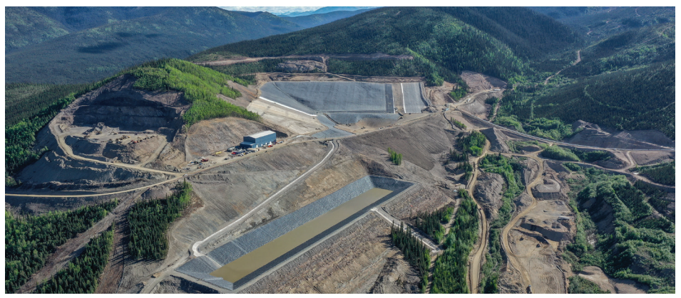
/ View of the lined Events Pond, Gold Recovery Plant and Heap Leach Facility