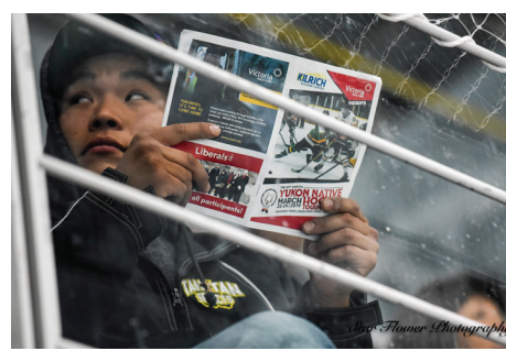
/ Spectator at the Yukon Native Hockey Tournament

Every Student, Every Day Gala Whitehorse