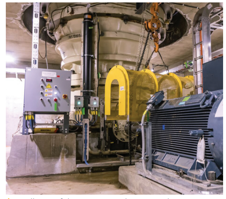
/ Installation of the Primary Crusher is complete