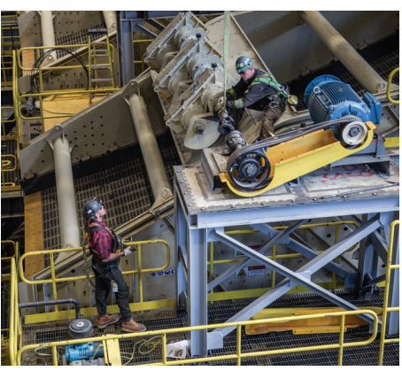
/ Finishing the installation of one of three Tertiary Crusher screens.