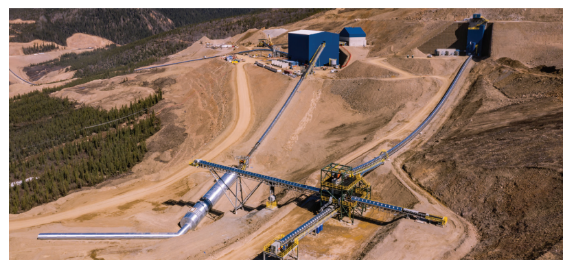
/ View of the conveyor system between the Primary Crusher (blue building on the right) and Secondary/Tertiary Crusher (blue building on the left).

As of early June we are now over >1,400,000 safe work hours without a lost time incident.