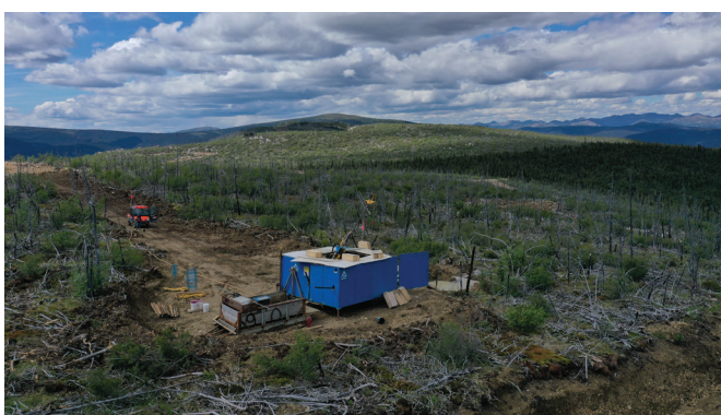
/ Exploration Drilling at Raven – July, 2020

2019 was a momentous year for Victoria and the Eagle Gold Mine as the company advanced the mine to operations over the summer and executed its first gold pour and this achievement was bolstered by the exploration success at Raven. Victoria's exploration team looks forward to another busy and production season in 2020.