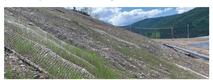
/ Control Pond jute fibre and seed growth in 2020