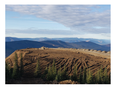
Platinum Gulch Pilot scale cover trial overview during construction

As well, trials on seed mixtures for ongoing and final revegetation efforts at the mine have continued with great success. A native northern species mix used in these trials performed particularly well and has now become a prime candidate for Eagle's revegetation programs. To prepare for 2021 seeding, trial plots were established that test locally harvested seeds from a First Nation of Na-Cho Nyak Dun joint venture, Yukon Seed & Restoration Inc. Support for this year's programs was bolstered by local summer students and Laberge Environmental Services.