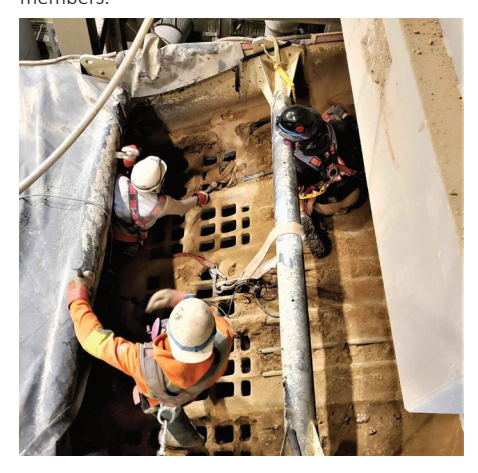
/ Maintenance crew working on the Secondary Crusher screen deck.

We look forward to 2021 which will be the first year of full production at the Eagle Gold Mine. The Company remains committed to meeting and exceeding government mandated COVID-19 measures in order to continue to protect the health, safety and wellbeing of our employees, contractors, suppliers, partners and community members.