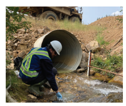
/ Monitoring water quality at the Eagle Gold Mine.

of available materials on site will be important information in designing the full-scale waste rock storage area cover system. Okane Consultants are providing expert guidance for this program.