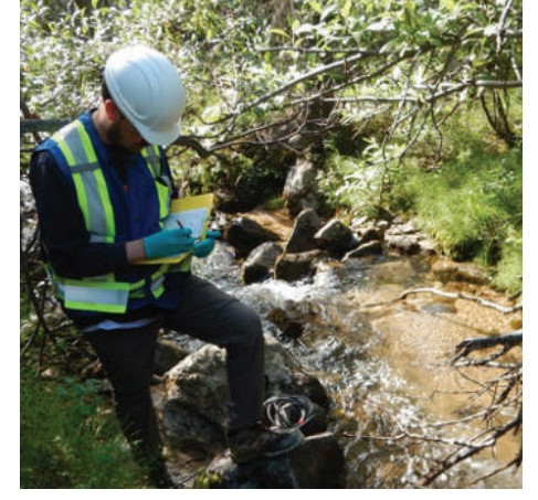
/ Monthly Water Sampling in the area of the Olive deposit

Summaries of the existing conditions for each of the candidate VESECs are provided in our Virtual Open House Forum available at: eaglegoldmine.ca/extensionproject/