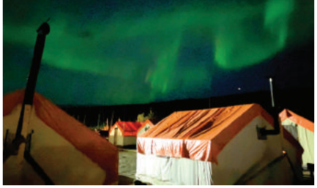
/ View of the Raven camp, Fall 2020

The team looks forward to planning the 2022 Exploration Program to include Nugget, Raven, Lynx, and other targets on the greater Dublin Gulch property.