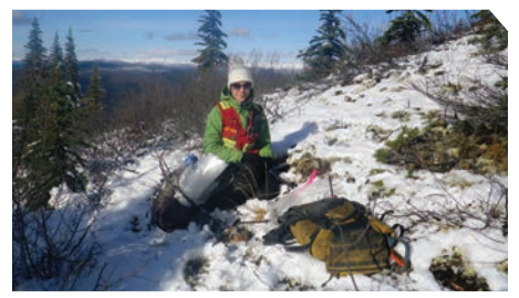
Exploration on the VBW claim block.

This year's Dublin Gulch exploration program started in late July with a mapping and prospecting program in the areas of Potato Hills East and Lynx Dome. Ground Truth Exploration conducted a Direct Current (DC) resistivity survey over the Eagle Gold Mine pit area in August. This survey is part of a Yukon wide study, funded by the Yukon Geological Survey, to test the effectiveness of this technology using known gold deposits as test cases. The results of the DC resistivity survey will be published early next year.