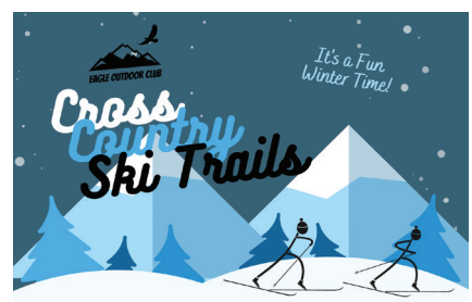
2 SET TRACKED TRAIL OPTIONS