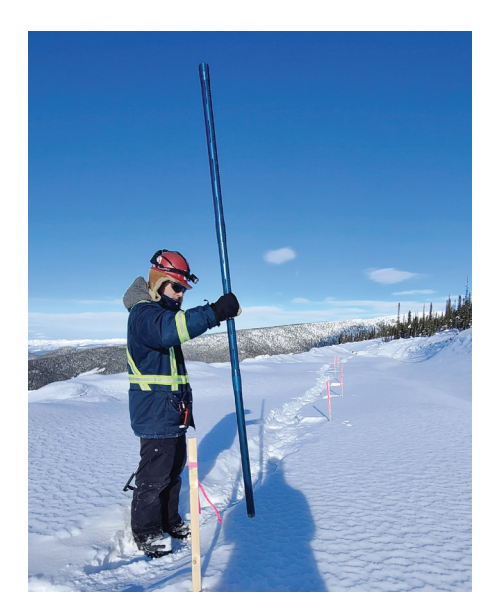
/ Heap Leach Facility Snow Survey

By understanding the snowpack dynamic and following local forecasted weather, we can better predict the spring runoff. The detailed records collected throughout the winter months provides valuable information for the team to make informed water management decisions.