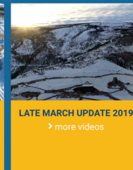
LATE MARCH UPDATE 2019 > more videos