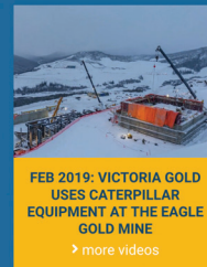
FEB 2019: VICTORIA GOLD USES CATERPILLAR EQUIPMENT AT THE EAGLE GOLD MINE > more videos